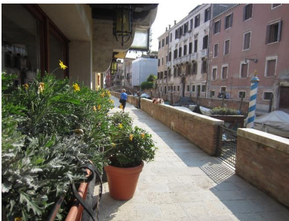
View from Hotel American Dinesen