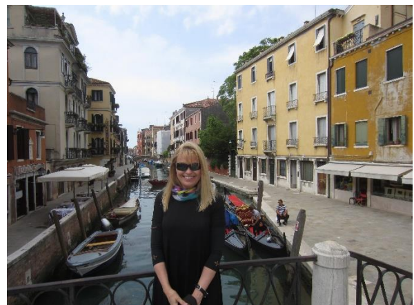
Hotel Dinesen is 3 rd Building on Left